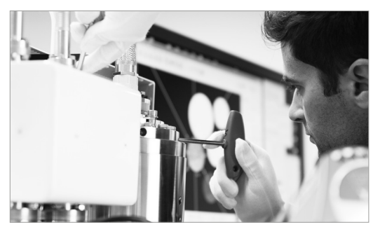
Profit from the optimized performance of your microscope system with services from ZEISS – now and for years to come.